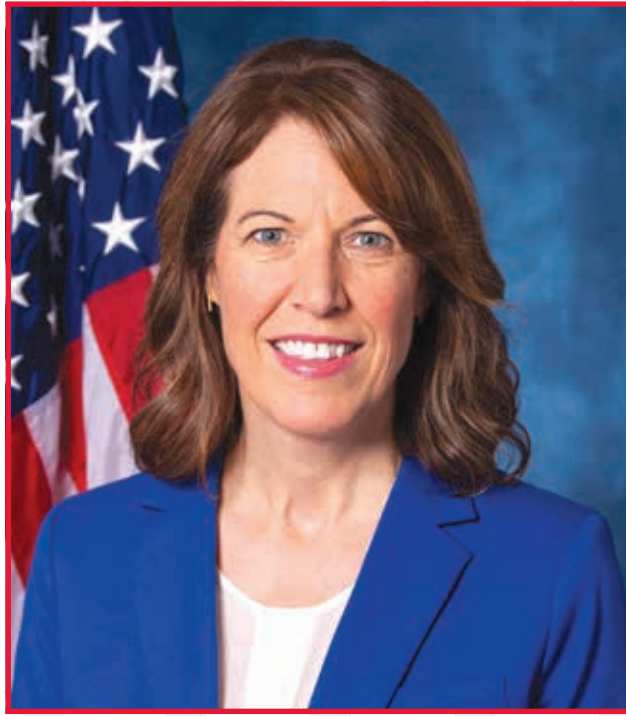
Cindy Axne US Congressional District 3