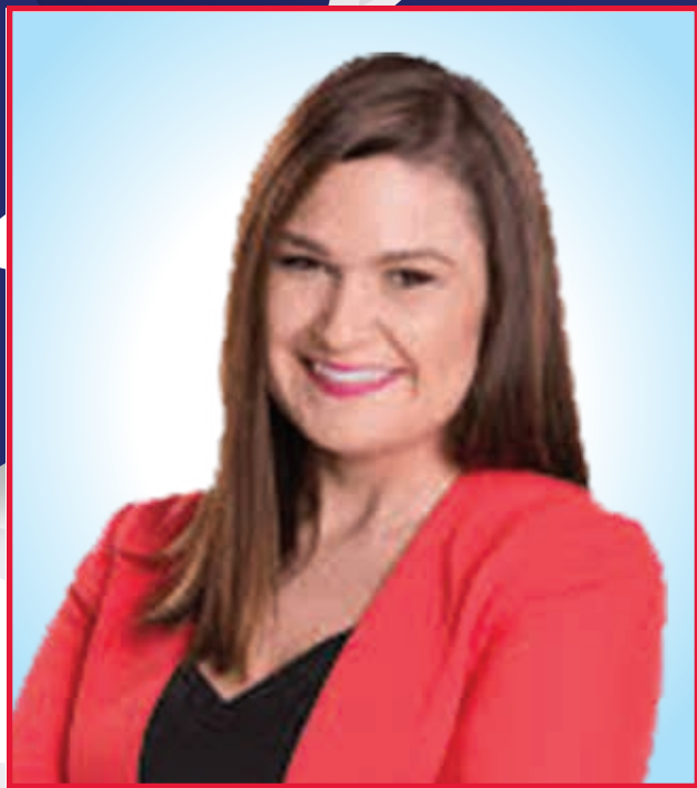
Abby Finkenauer US Congressional District 1