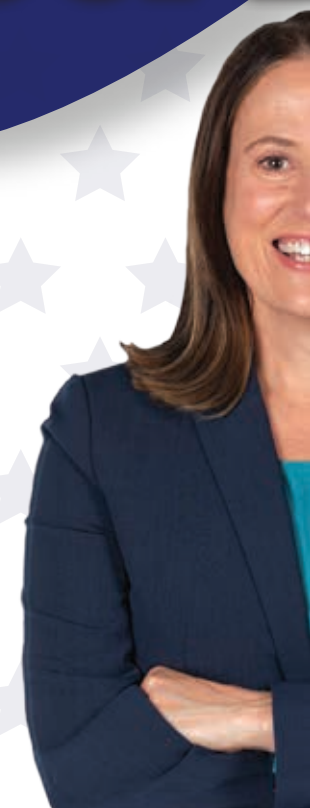
Theresa Greenfield US Senate