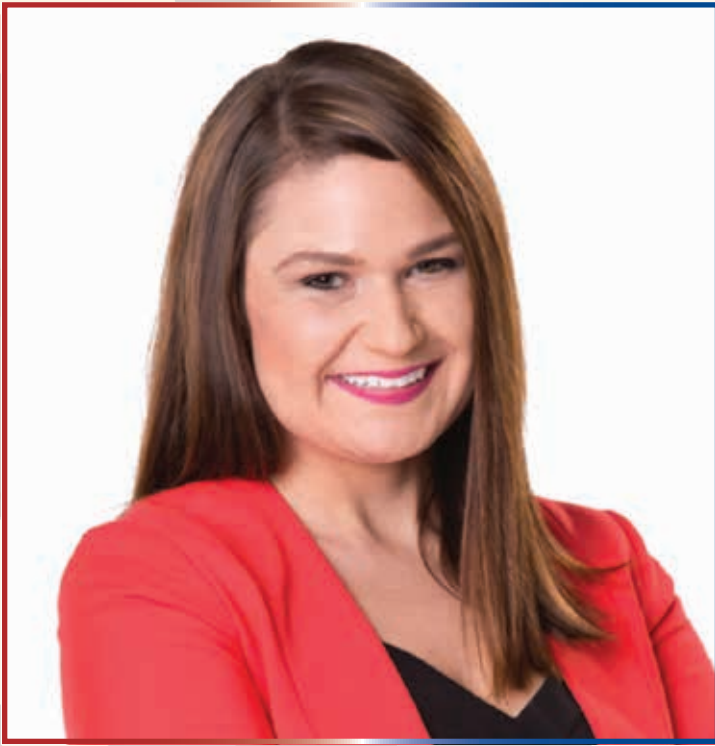
US Congress – CD 1 Abby Finkenauer