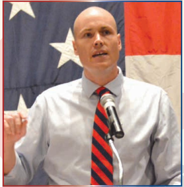
US Congress – CD 4 JD Scholten