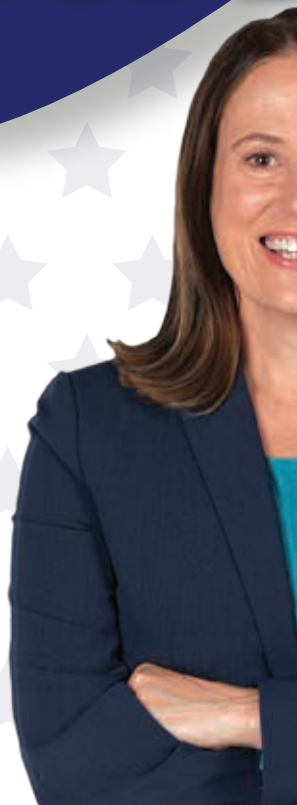
Theresa Greenfield US Senate