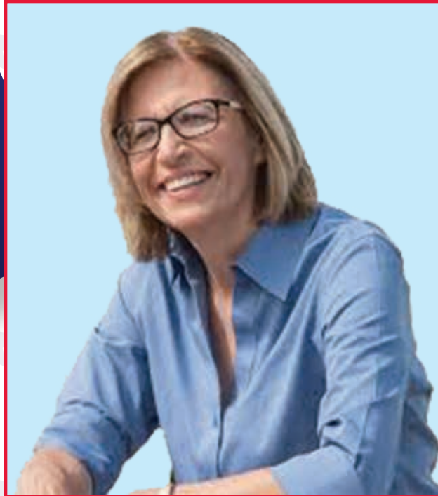
Rita Hart US Congressional District 2