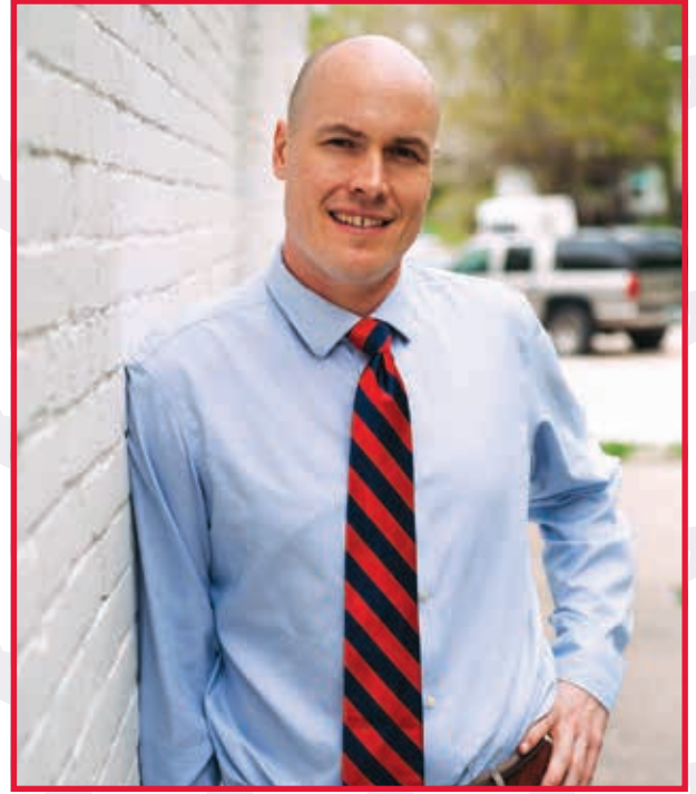
J.D. Scholten US Congressional District 4